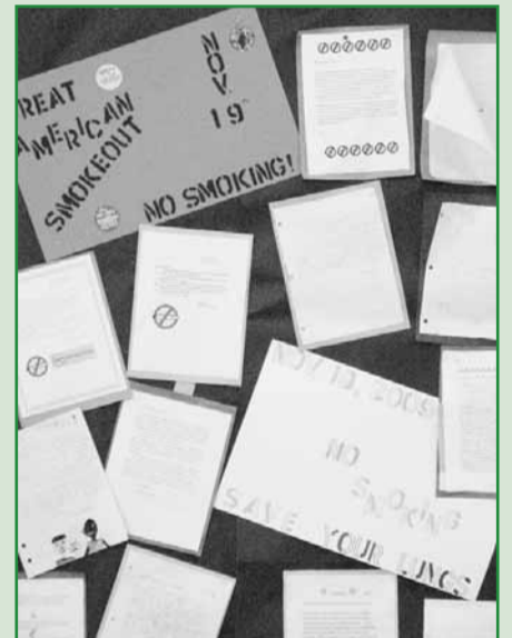
Pictured is the display of letters which TJL students wrote to High School buddies.

This year, Thomas J. Lahey students wrote letters to Middle and High School students reminding them of the dangers of tobacco use. The letters were displayed on bulletin boards, as well as placed inside of a basket in the nurse's office at both OMS and at the High School for students to read. In addition, students at TJL welcomed High School students with lollipops and stickers as they exited their buses. The TJL volunteers who made the trip asked High School students to wear the stickers in support of The Great American Smokeout and to have a lollipop that day, instead of a cigarette. For those who didn't smoke, they were asked to pass the lollipop on to a family member who could use it instead.