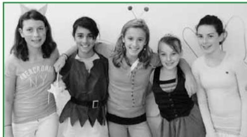
Seventh-grade students dressed as such characters as Peter Pan and fairies.

In celebration of Teen Read Week, members of the National Junior Honor Society dressed up as storybook characters and spoke in homerooms about reading. In the spirit of "changing the reality of someone," the NJHS also held a book donation drive to benefit teens through the Huntington Family Service League. The library played fantasy music all week to encourage the selection of fantasy books. The week culminated with students dressing as their favorite character from a book they read.