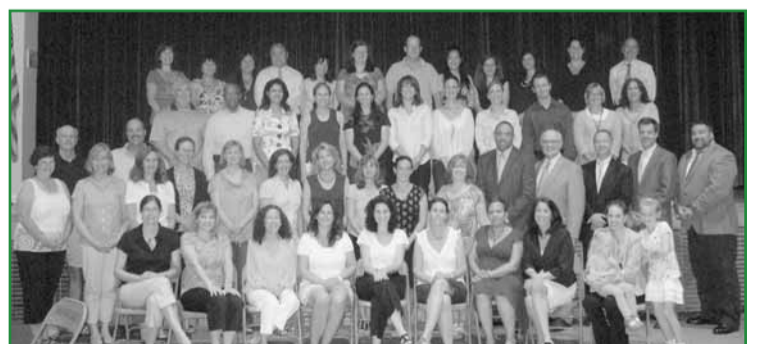
All 2010-11 district volunteers were also recognized with a special reception for all they do on behalf of the district.