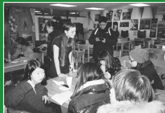
Harborfields High School students welcome the Korean students and provide them with an overview of what a "typical" day at the high school is like.