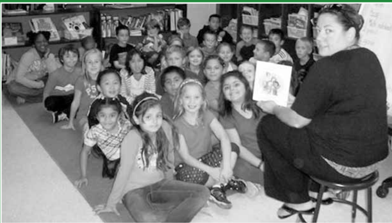
Third-grade students participate in a special Autism Awareness lesson at Thomas J. Lahey Elementary School.