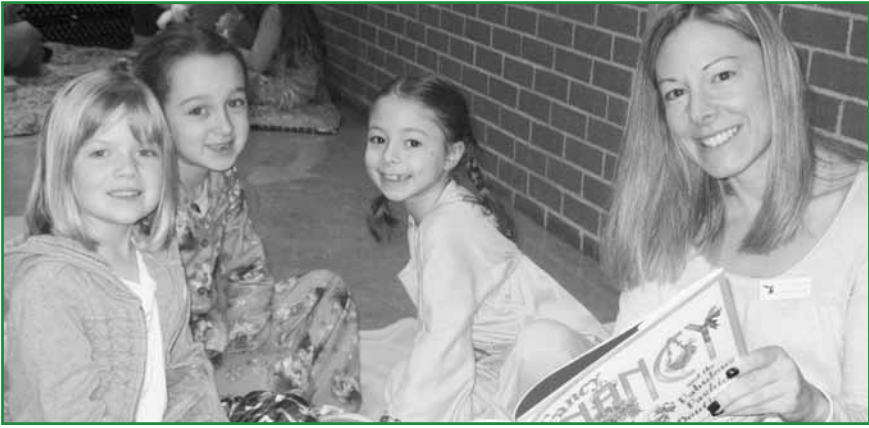
Parents at Washington Drive Primary School participate in the PARP Read-In as they share a selection of books with students.