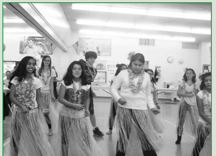
Members of the Multicultural Club perform the Hukilau Dance.