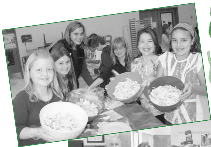
Students at Thomas J. Lahey Elementary School bake pies for families in need.