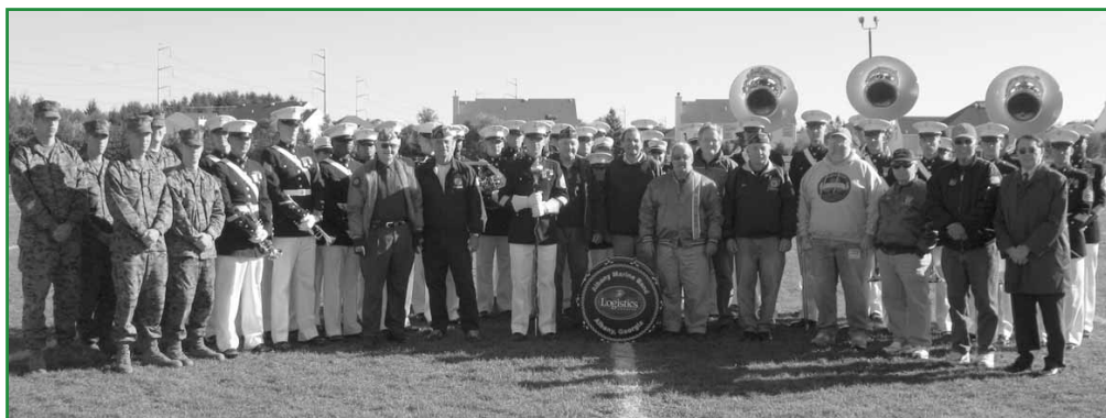
Members of the Albany Marine Band with administrators from the Harborfields Central School District.