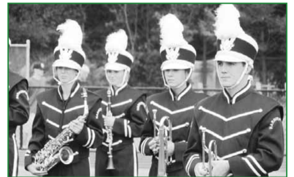
Members of the Harborfields High School Marching Band perform during the Homecoming halftime show.