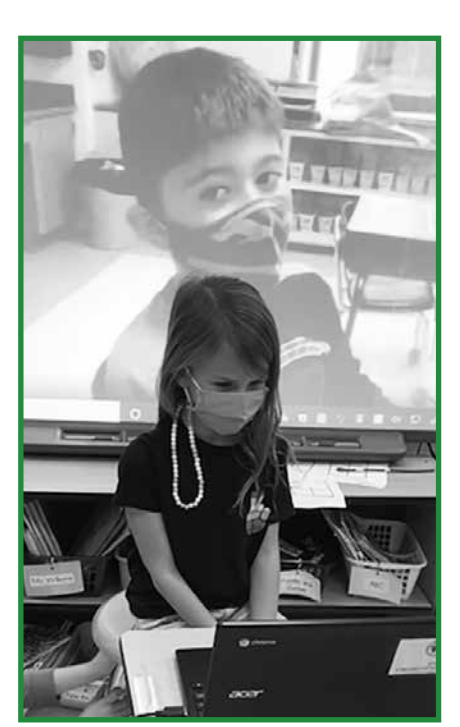
Students at Washington Drive Primary School connected with their classmates during the school's first "Chew and Chat" session on Oct. 20.