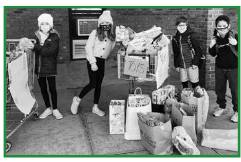
Thomas J. Lahey Elementary School students donated toys and pajamas to benefit families in need for the holidays.