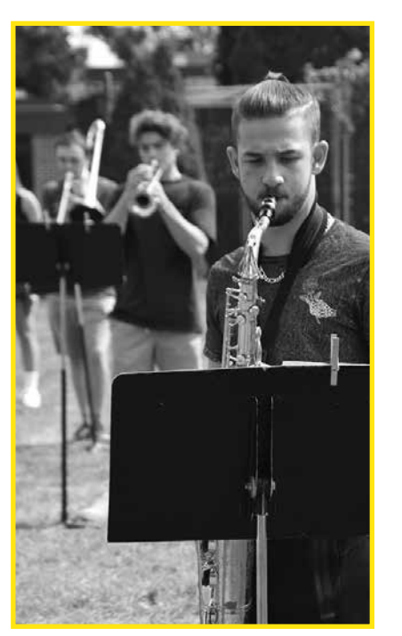
Harborfields High School band students safely practice together with their classmates during lessons and rehearsals.