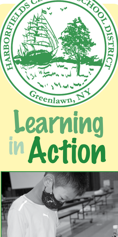
In a STEAM-related art project, Washington Drive Primary School second graders learned the importance of perseverance and determination when building creations out of recycled materials.